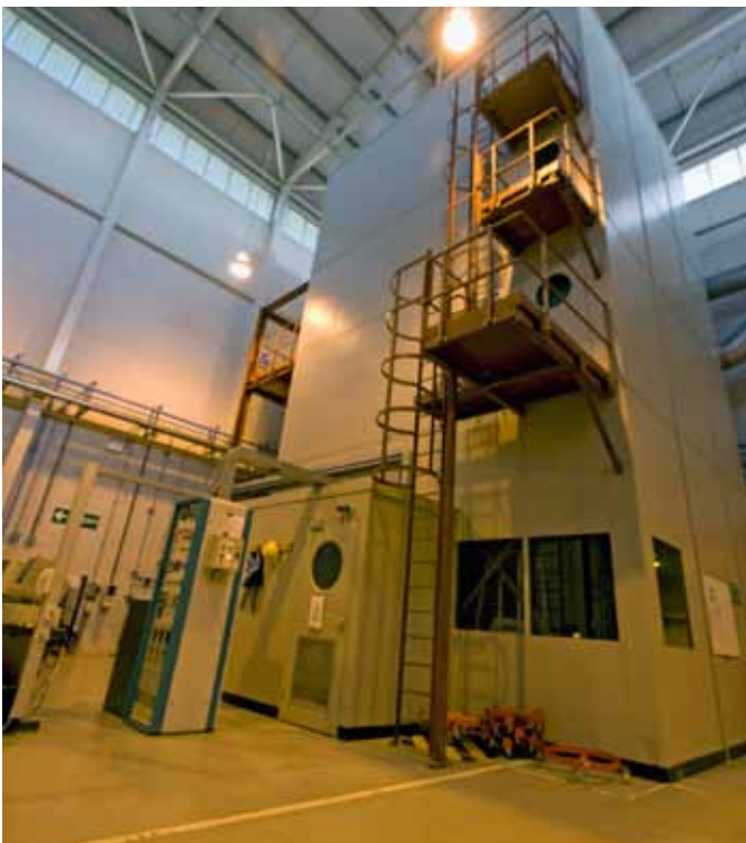
The Uranium Commissioning Facility at Springfields