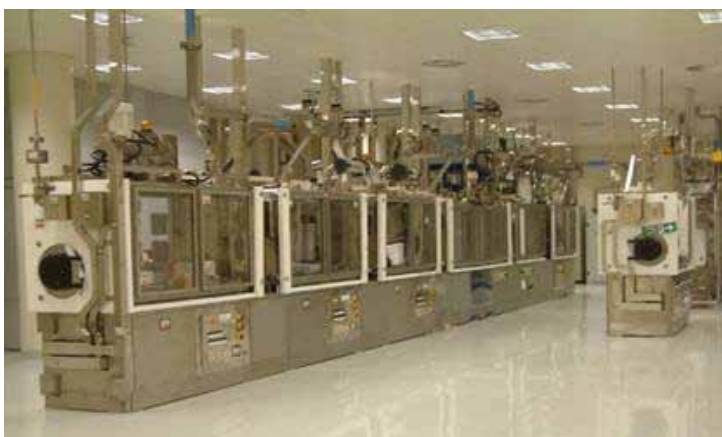
The Fuel Line at NNL's Central Laboratory, Sellafield

This paper sets out the rationale for a fuel manufacturing R&D programme together with the skills and expertise required to implement it.